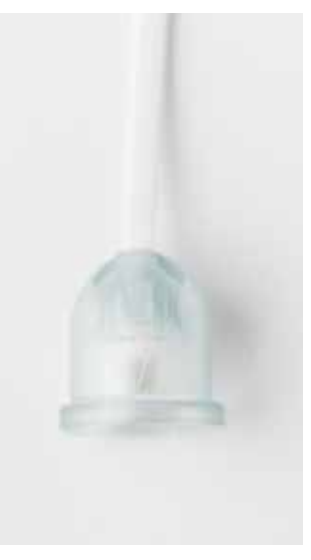
Precise and safe real-time blood pressure measurement to manage critically ill patients - in one device.